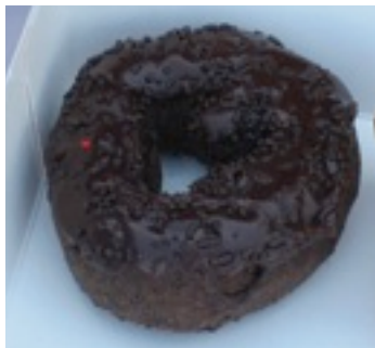
Fuel for the big race.

Mid-Hudson followed the tradition established in recent years by entering a mixed 8 in the Poughkeepsie Row for the Cure on June 2. Our race strategy is to practice with everybody in their assigned seats all the way from where we launch the boat to the starting line on the morning of the race. No chance of the crew peaking too early in the season.