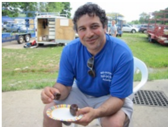
Carb loading for the mixed eight race!

The strategy for next year is to establish better communications with race officials.