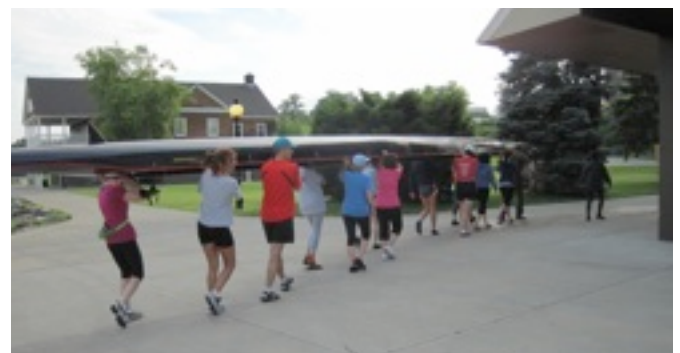
Retrieving the Terry Macken from the Marist Boathouse