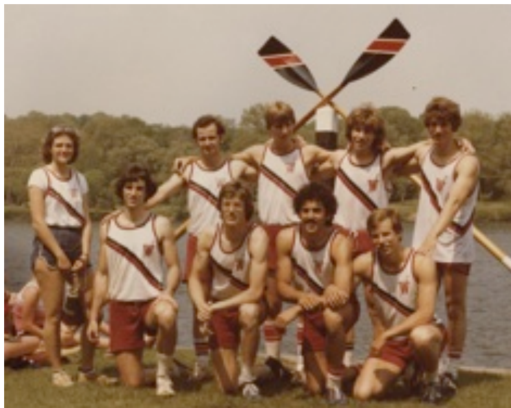
1979 Wesleyan Lightweight Varsity taken at the Dad Vail Regatta in Philadelphia.