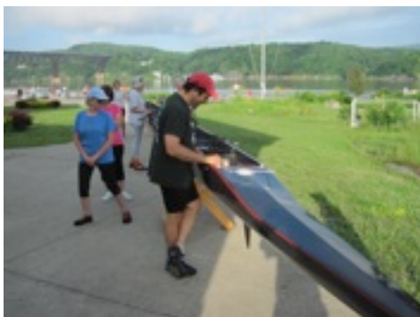
Inspection of the Macken

Mid-Hudson Rowing has purchased an eight oar shell from Marist. On Saturday, July 29, a bunch of members and LTR participants marched north to the Marist boathouse and retrieved the shell named Terry Macken . The shell is a 1999 Vespoli Millennium DL.